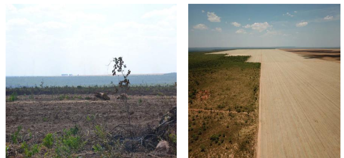
Deforestation and farming areas sample