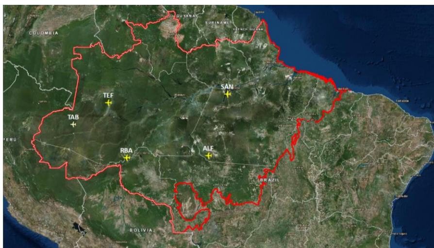
Figure 1 – Study area and Carbam flight sites